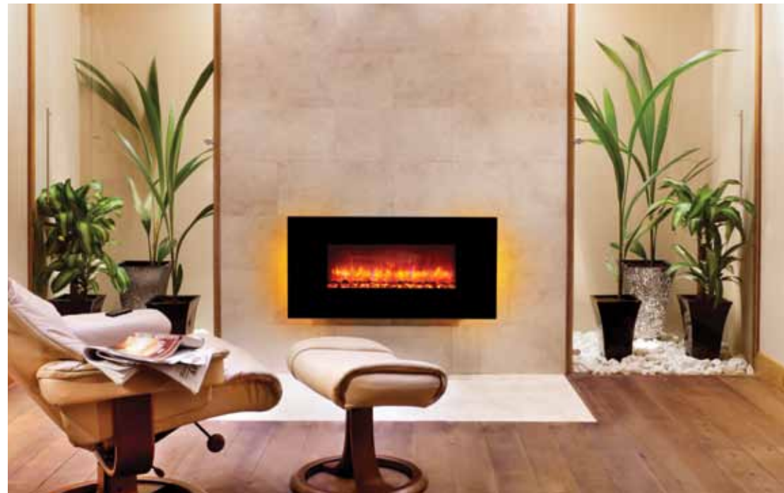
Wall Mounted & Inset fires

With its enduring quality and timeless design, your choice from this stunning collection will look as though it's been part of your home for ever. Yet it's quick, clean and simple to install with no need of chimney breast or flue, and the latest LED technology cosily creates the shimmering effect of logs or coals.