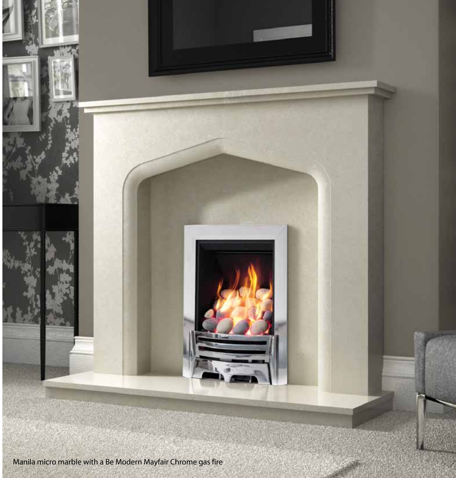
Manila micro marble with a Be Modern Mayfair Chrome gas fire