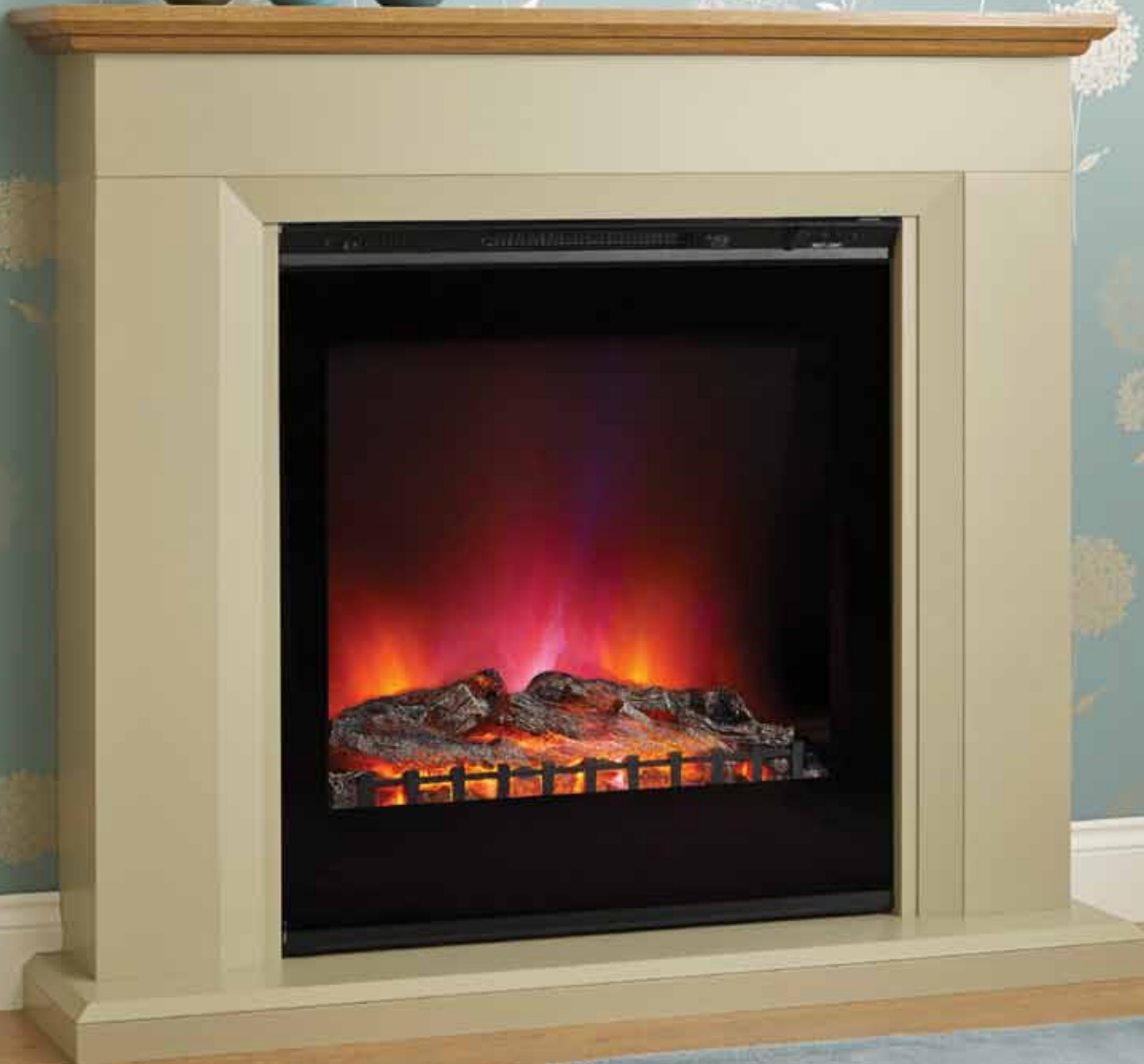
Linen finish complete with mantel top in Country Oak finish