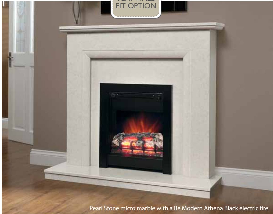
Pearl Stone micro marble with a Be Modern Athena Black electric fire