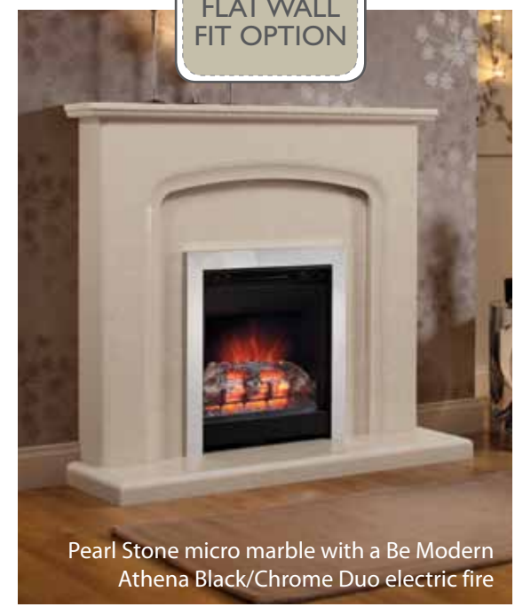
Pearl Stone micro marble with a Be Modern Athena Black/Chrome Duo electric fire

We believe the bullnose hearth is perfect for Siena.