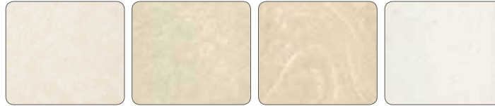
A Italia B Manila C Pearl Stone D White