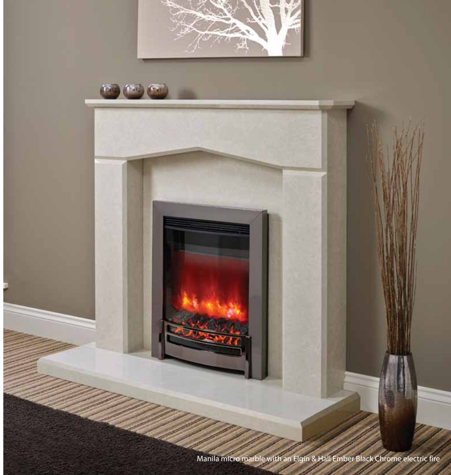
Manila micro marble with an Elgin & Hall Ember Black Chrome electric fire

Admire the effect with Smartsense lighting.