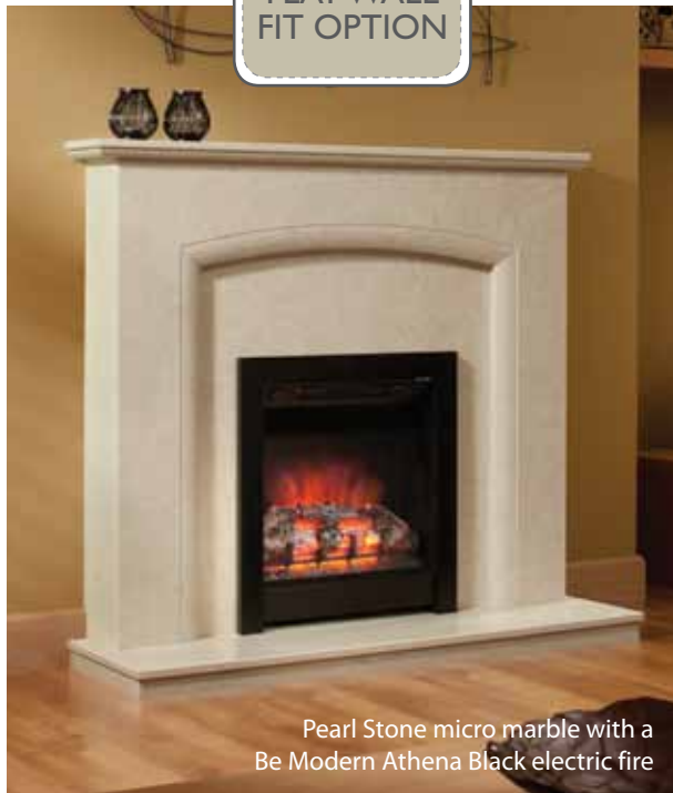
Pearl Stone micro marble with a Be Modern Athena Black electric fire