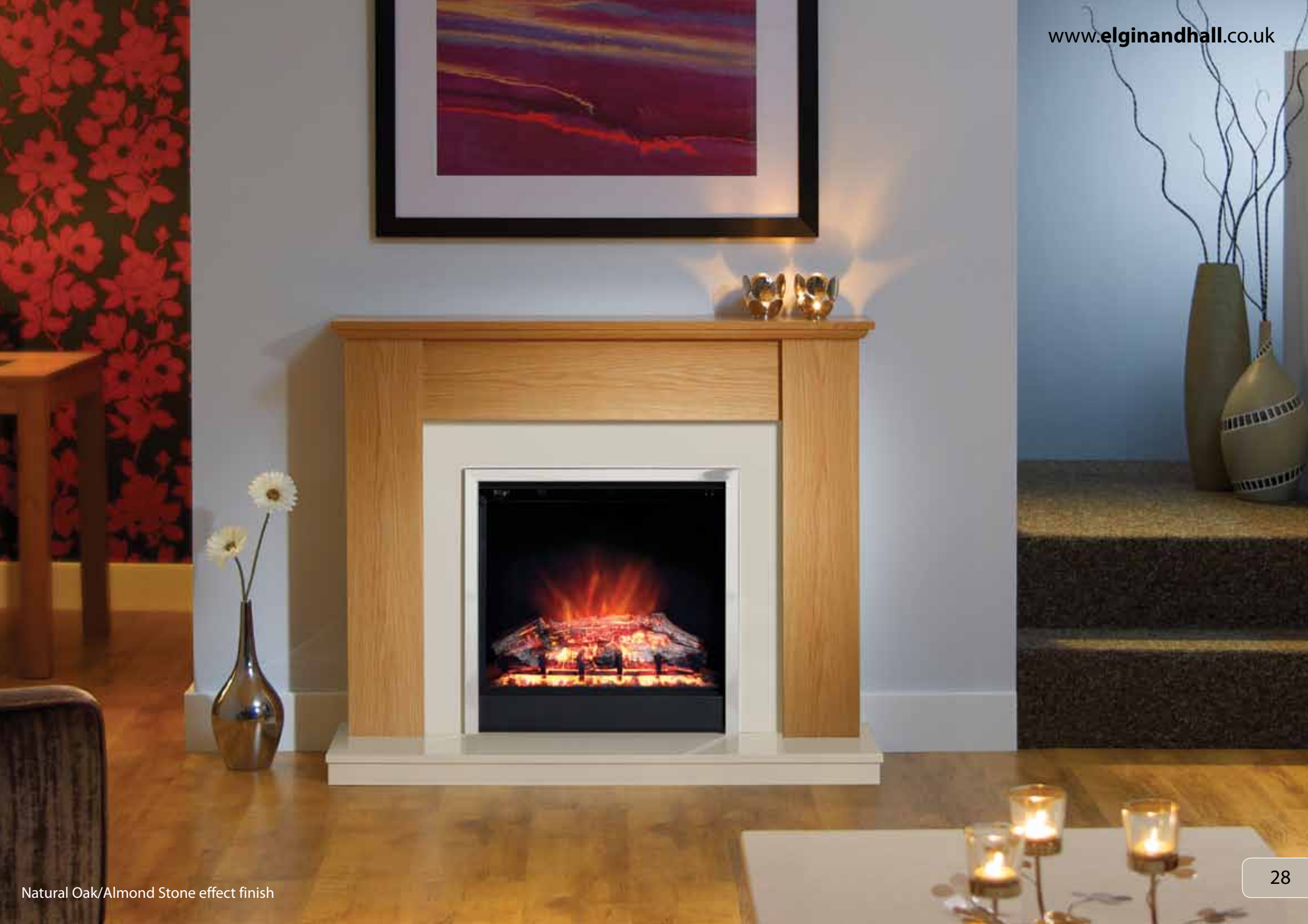
Natural Oak/Almond Stone effect finish