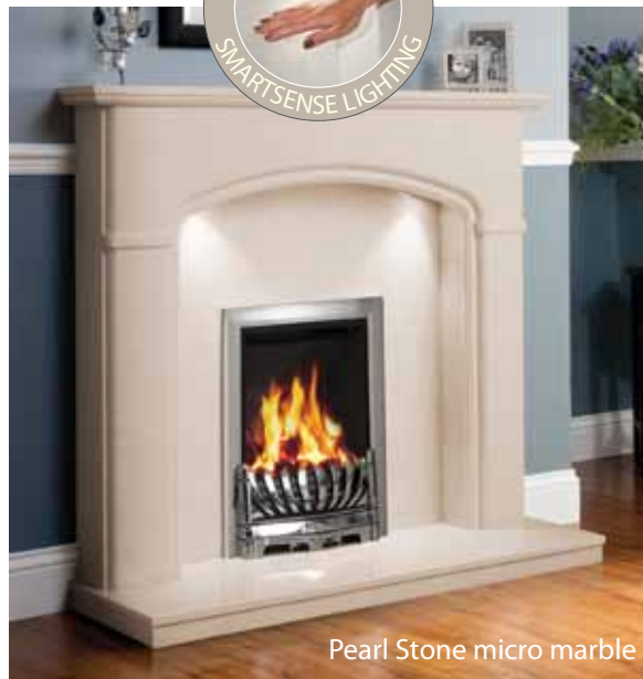
Pearl Stone micro marble