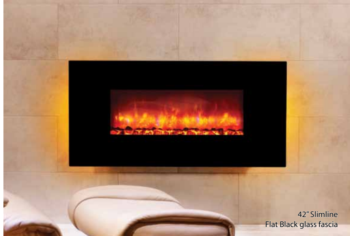
42" Slimline Flat Black glass fascia

Place in position. Plug in. Switch on. Enjoy!