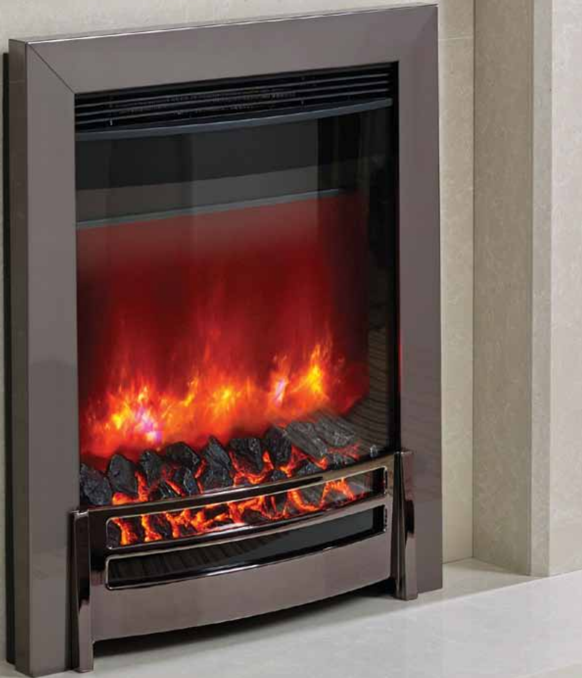
Black Chrome finish

The trim is in lustrous Chrome or Black Chrome and the fret - magnetically attached to the base of the fire - has that full Chrome sheen. You can fit Ember into many different fire surrounds, including those with the "deep rebate" option that allows installation against a flat wall.