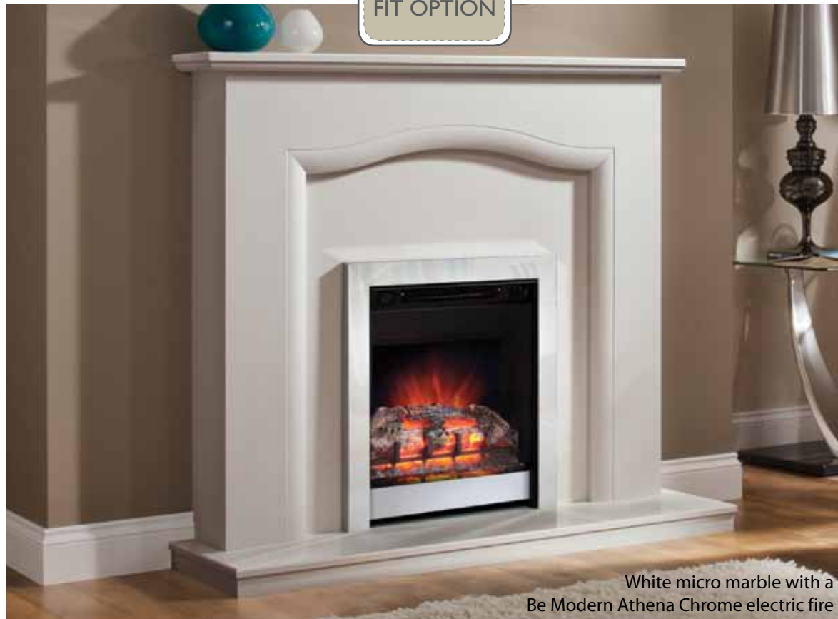
White micro marble with a Be Modern Athena Chrome electric fire