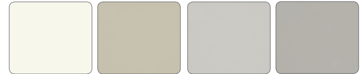
J Ivory K Linen L Stone M Suede