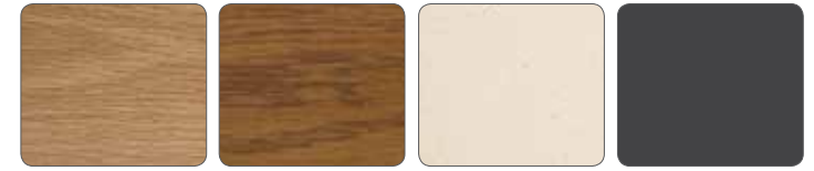
F Natural Oak G Country Oak H Almond Stone I Anthracite