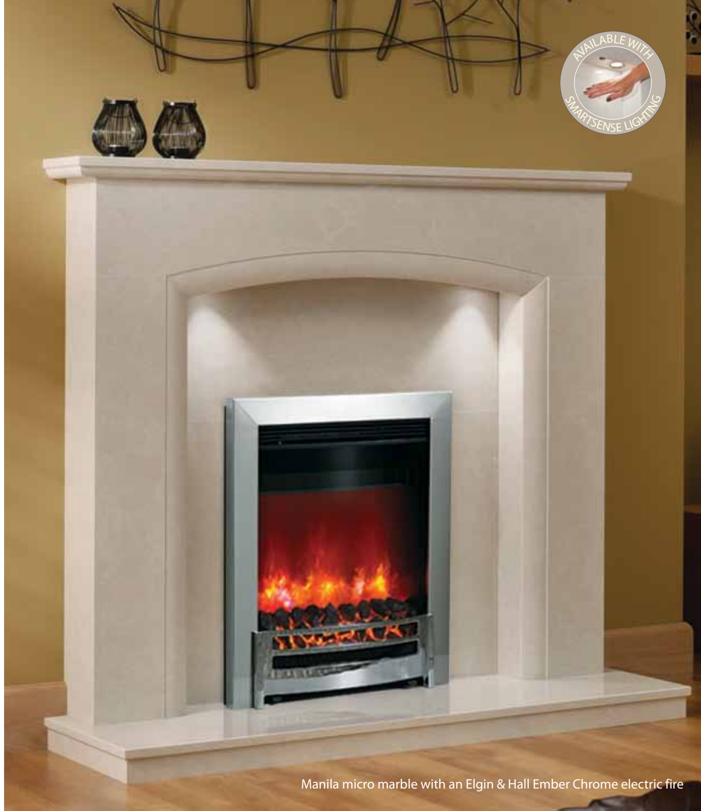
Manila micro marble with an Elgin & Hall Ember Chrome electric fire