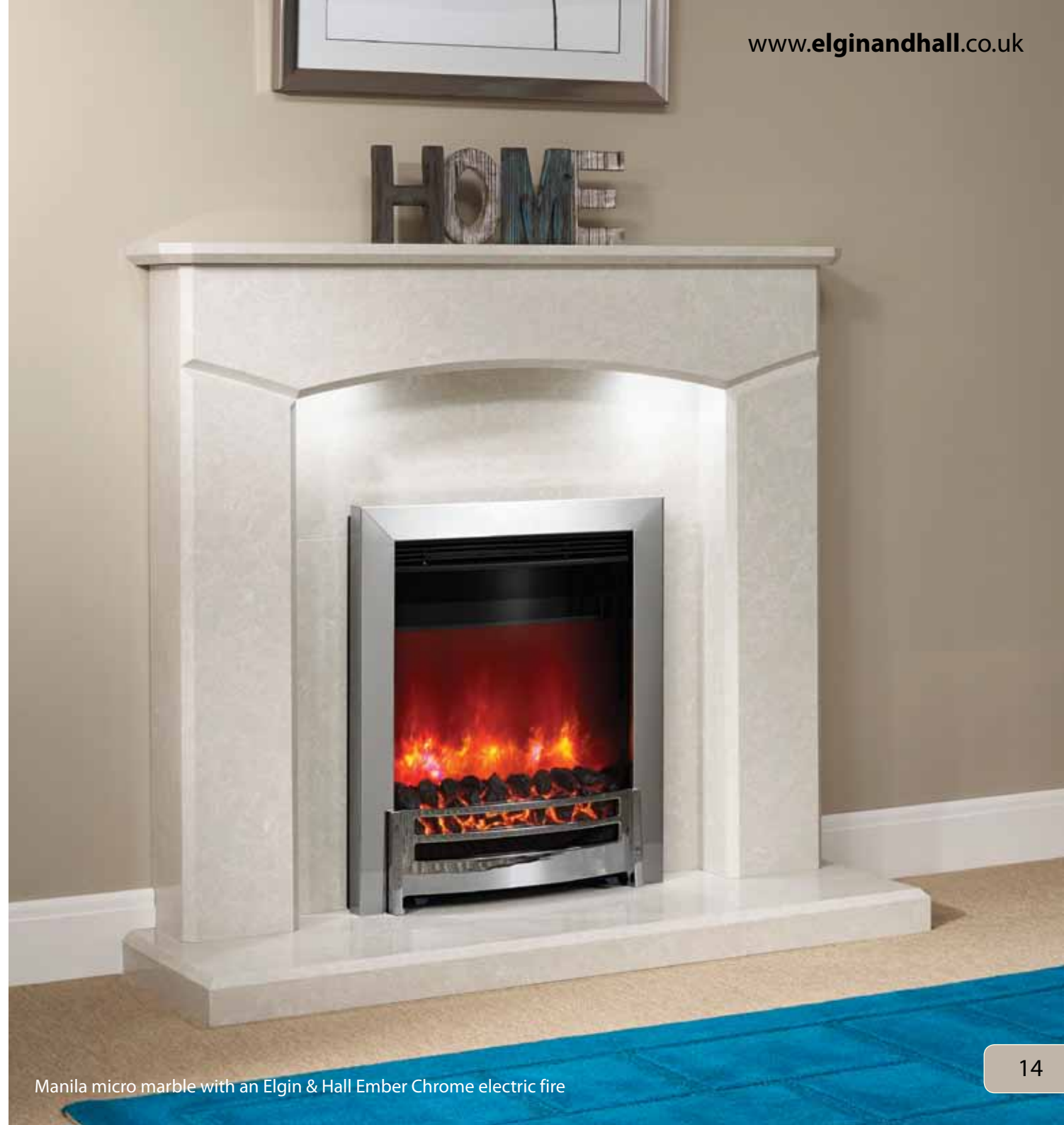
Manila micro marble with an Elgin & Hall Ember Chrome electric fire

This gracious member of the marble family surprises the eye where the bevelled curve of the brow meets the inner corners of the surround. Here chamfered edges glance upwards, lending lightness to the substance of marble.