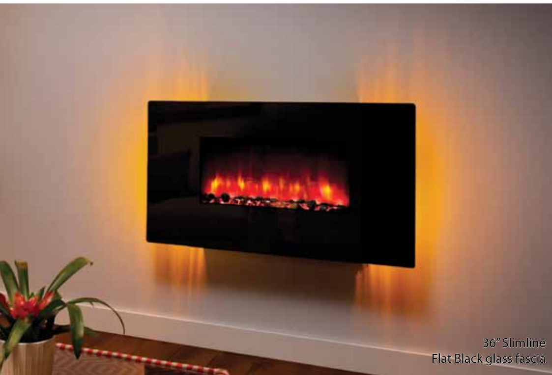
36" Slimline Flat Black glass fascia