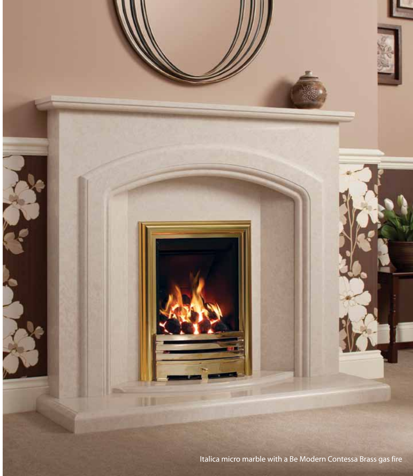
Italica micro marble with a Be Modern Contessa Brass gas fire

What makes a masterpiece: the forward standing arched brow and pillars, the pretty step up from the bullnose hearth, the double contoured mantel top....or simply the whole harmonious combination? It's your pleasure to decide.