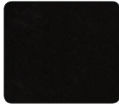
E Black Granite