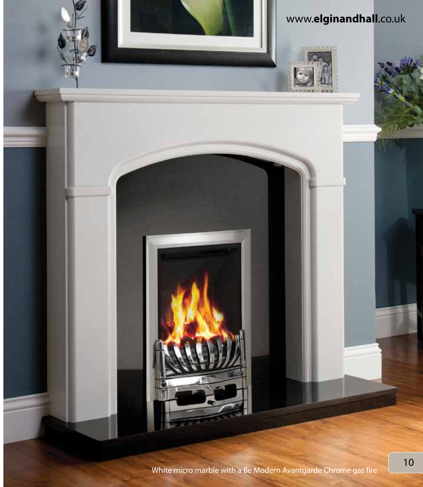
White micro marble with a Be Modern Avantgarde Chrome gas fire