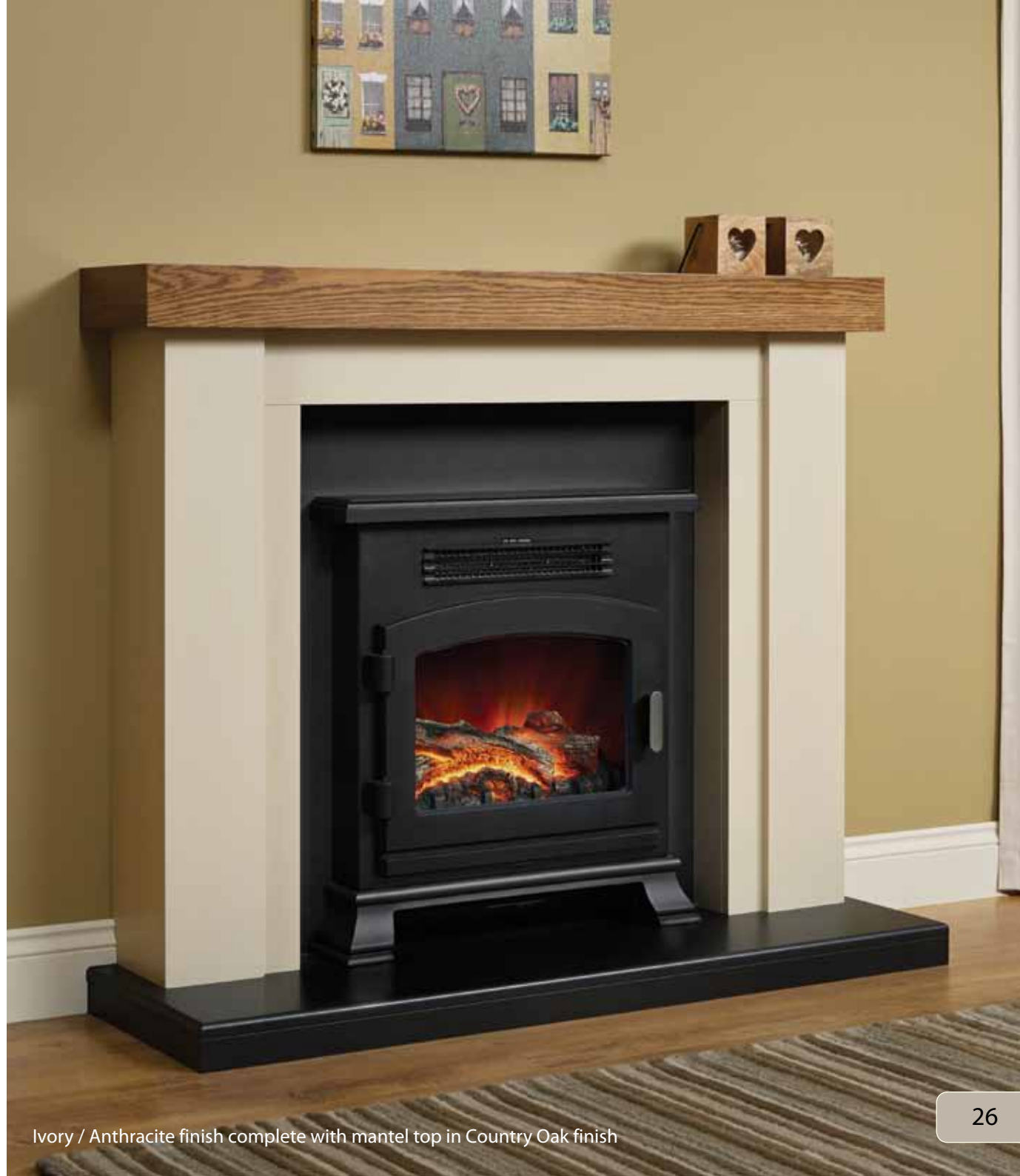
Ivory / Anthracite finish complete with mantel top in Country Oak finish