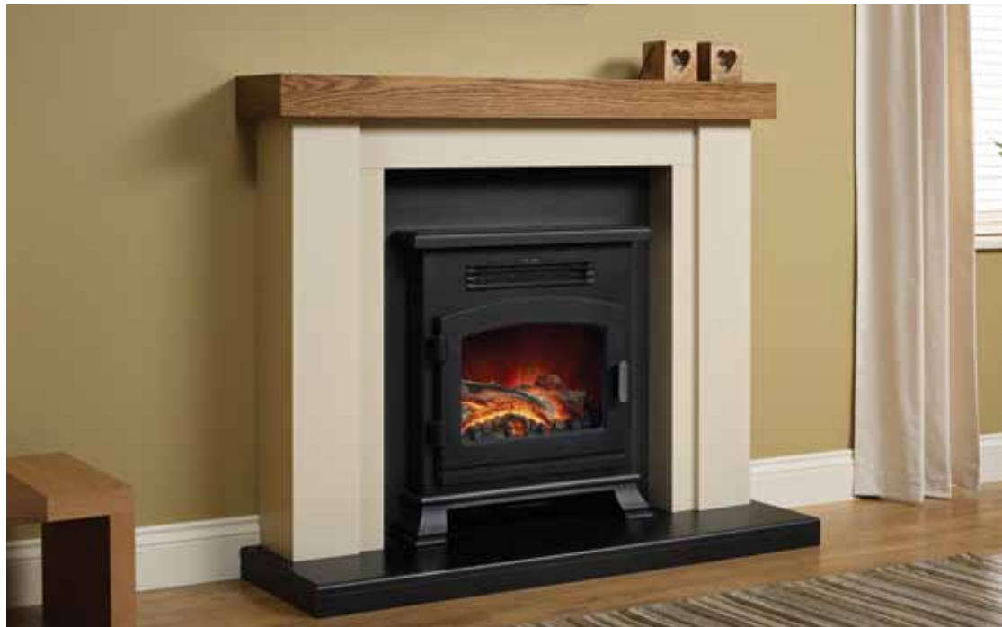
Electric Fireplace Collection

that is anything but ordinary.. ...welcome to Elgin and Hall