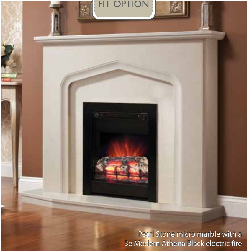
Pearl Stone micro marble with a Be Modern Athena Black electric fire