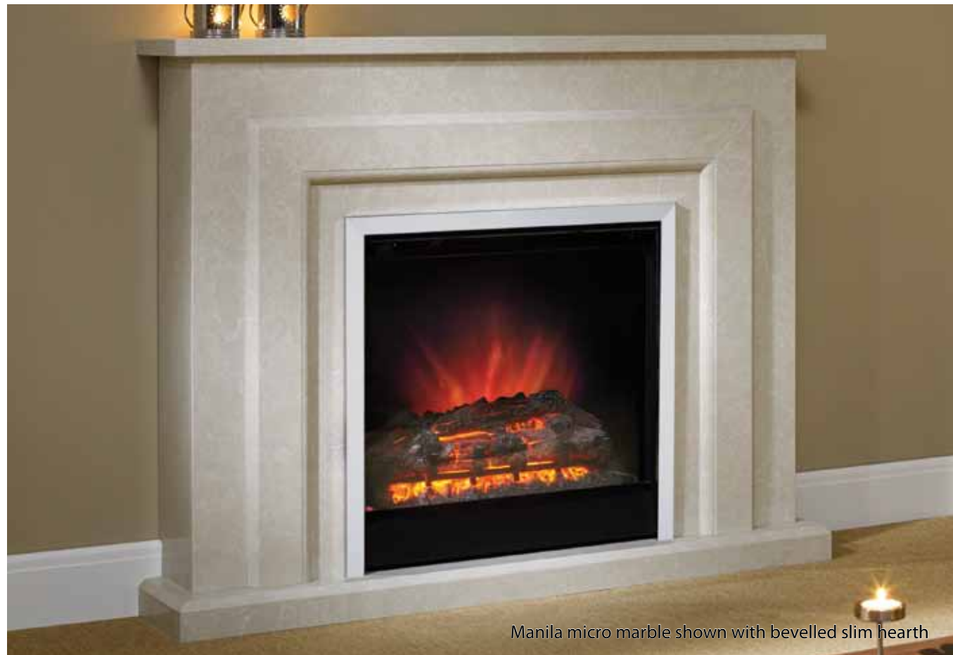
Manila micro marble shown with bevelled slim hearth

The angular architecture is given an extra dimension by a window frame shape stepping forward from the surround with the fire as a flickering centrepiece. Farnham comes in two options – a Manila micro marble version with a choice of bevelled or bevelled slim hearth and a painted Almond Stone version which gives the effect of real marble.